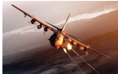
Aviation & Aerospace

2015 TACOM Cable Assemblies for Weapon Systems 2014 NASA Goddard Space Flight RF Components 2013 Defense Logistics Agency (DLA) Electrical Mounting Bases for the Air Force Aircrafts 2012 Edwin Bohr Electronics - Electronic Mechanical Box Assemblies & Cables for Railroad (Conductor boxes & Cables for the Trains) 2011 Computer Science Corp (CSC) Military Cables & Wire Harnesses for Weapon Satellite & Weapon Systems 2010 Northrop Grumman PCB Assemblies for Robots 2007 Lockheed Martin Curtis Wright /Target Rock -Electronic Components -Wire Harnesses for Navy Nuclear Power Systems & Reactors 2006 ManTech International Military Cables for the Fire Finder, Trojan & Prophet Pro-grams